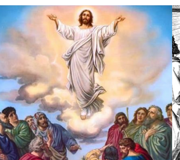
The Acension of our Lord occurs 40 days from resurrection. This is when Jesus was physically taken up to heaven in the presence of his apostles.

THE CHURCH CELEBRATES THE FIRST FRIDAY AFTER THE FEAST OF THE PENTECOST AS GOLDEN FRIDAY. THIS IS BASED ON THE INCIDENT DESCRIBED IN ACTS OF THE APOSTLES CHAPTER 3 VERSE 1-10. THE CHURCH COMMEMORATES THE MIRACULOUS HEALING OF THE LAME MAN BY ST.PETER AND ST.JOHN. BOTH NAMES, PETER AND JOHN, WERE GIVEN A SYMBOLIC MEANING. PETER MEANS ROCK WHICH REPRESENTS FAITH AND JOHN REPRESENT LOVE.